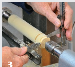
3 Part the tenon shoulders down to a slightly oversized diameter.