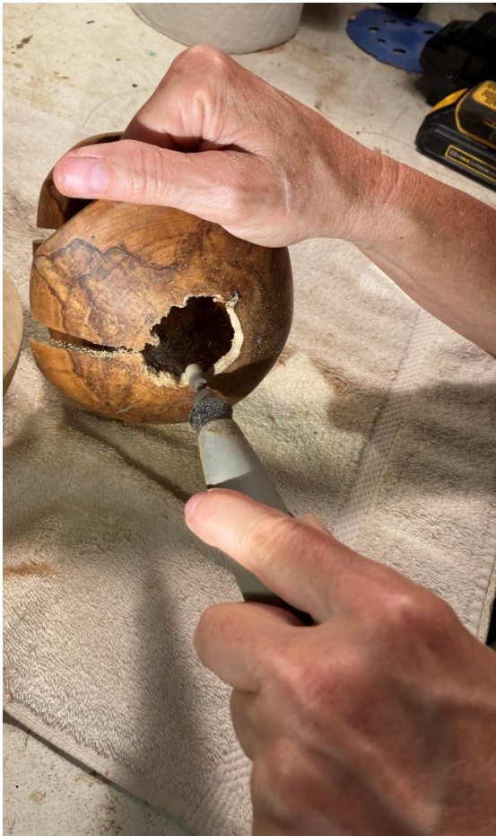
After the centers were removed, I used a Dremel to smooth the edges.