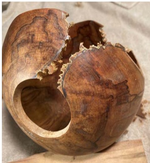
I used a similar process to redefine the crack from the rim to the eye.