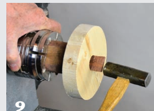
An undersized tenon on the jam chuck can be tightened with a wedge driven into a saw kerf.