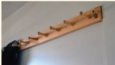
A hat rack featuring Shaker-style pegs is a practical turning exercise and another good place to park hats.