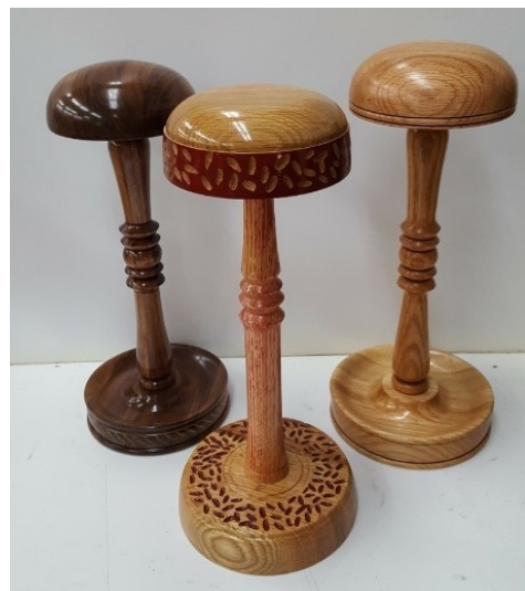
These wig stands were made by the Central Illinois Woodturners

This personal gift to someone who likely needs a lift during a life crisis is a gift of caring that will truly be appreciated. Please join us in this important project. For more information on instruction options and distribution, see WIT Home Page - Calls, Projects & Grants .