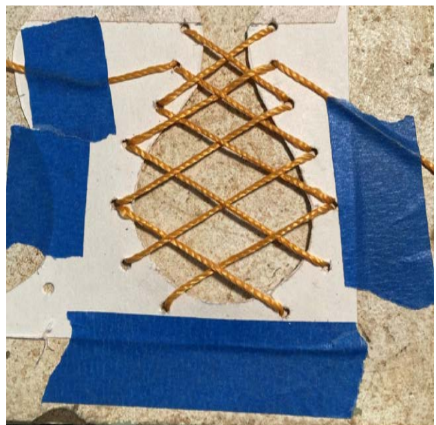
The next step was to determine the lacing pattern to use. After many trials, I chose the design shown and used the pattern to position the holes on both sides of the bowl.