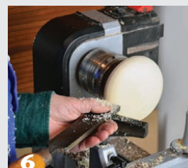
6 A freshly sharpened scraper produces paper-thin shavings and a smooth surface on the face-turned discs.