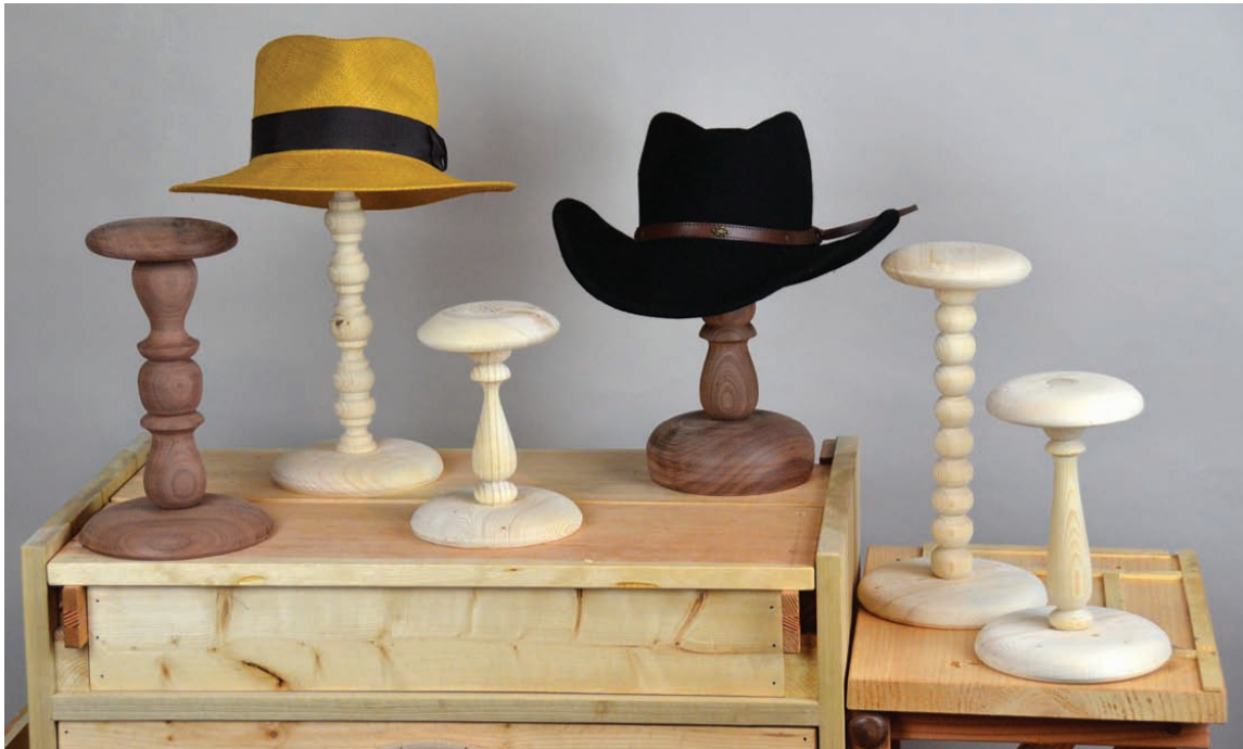
Hat and wig stands ranging from 7" to 14" tall, with 6" bases and 5" tops.

R ummaging through the library at the Center for Art in Wood in Philadelphia, I stumbled across several 100-year-old woodturning textbooks. They were filled with turning exercises and projects. Wanting to improve my skills with a gouge and skew chisel, I tried some of the traditional spindle exercises ( Photo 1 ).