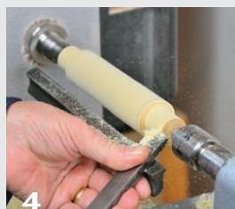
4 Trim the tenon with a skew chisel. Practice and patience combine for a perfect fit.