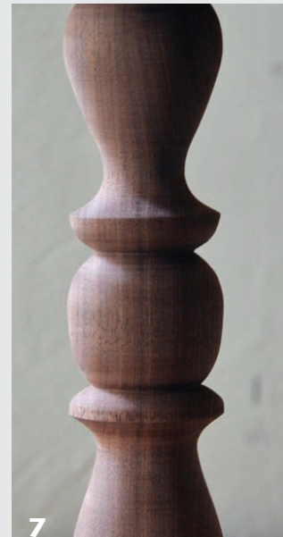
The vase shape at the top has a nice tension and turns its lip at 90 degrees, but the V transition to the ball is too sharp. The top half of the ball is rounder than the bottom half; it would look more spherical if the height matched its diameter. Okay, turn another spindle and keep practicing.