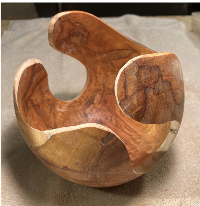
I finished smoothing the edges.