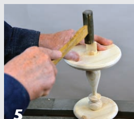
5 If the tenon is loose, add a narrow saw kerf and tap in a slender wooden wedge.