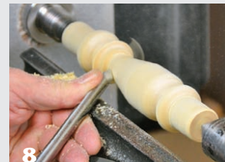
Working from the tailstock toward the headstock, shape the spindle elements with a gouge and skew chisel.