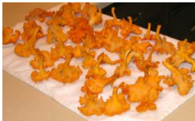
Chanterelle mushrooms ready to cook

mushroom is rare in southwest Tennessee, being a more northern variety, and rarely common anywhere. Competing closely as a favorite edible is the trumpet shaped chanterelle which does not show up often but when it does, it arrives in profusion and in the summer. Wet 2015 was one of those vintage