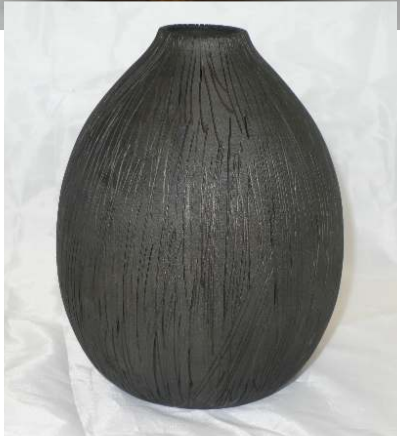
Maple HF Dyed and Textured