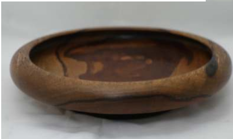
Paduk, Maple, Walnut