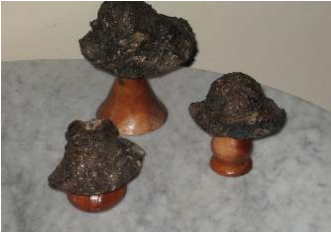
Madcap end grain from wild cherry burl

roughing gouges can hang up and snap the item quickly.